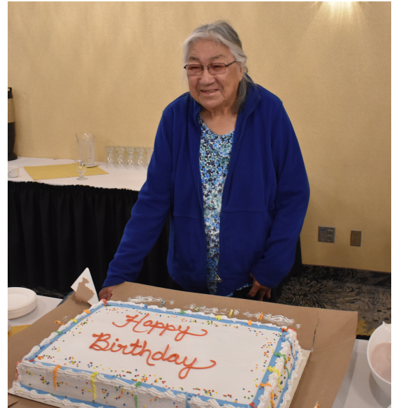
We celebrated her 80th birthday with her in July 2022